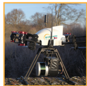
UNMANNED AERIAL VEHICLE

Bridgeway House 2 Riverside Way Nottingham NG2 1DP