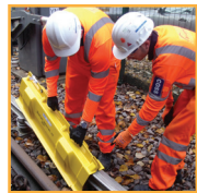
RAIL TRAINING & ASSESSMENT