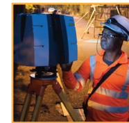
TOPOGRAPHICAL & UTILITIES