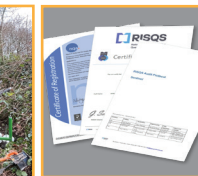
ASSURANCE & COMPLIANCE SERVICES